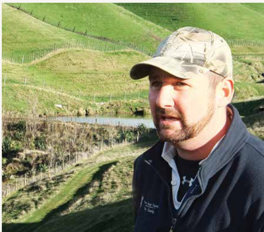
NZ Landcare Trust

Charteris decided to deer fence both sides of the waterway, leaving ungrazed space on the valley floor. Two catchment dams were built to let sediment settle out. The areas around the dams were planted in trees, shrubs and wetland plants. The surrounding paddocks are ready to stock with velveting stags. For more, see www.landcare.org.nz/SustainableDeer