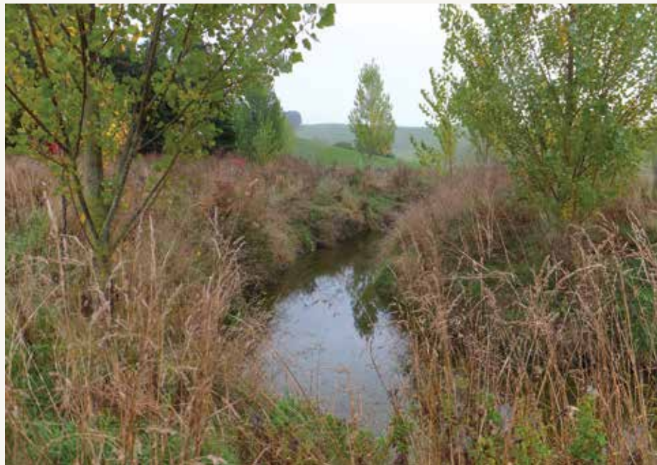
NZ Landcare Trust

Fifteen movie clips have been created by the NZ Landcare Trust Sustainable Farming Fund project to promote environmental best practice on deer farms. All 15 videos can be found at www.landcare.org.nz/SustainableDeer_