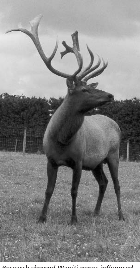
Research showed Wapiti genes influenced pregnancy rates in Red Hinds.

Wapiti deer have been used widely across New Zealand deer, and the percentage of