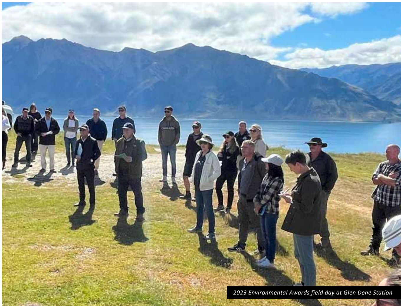
2023 Environmental Awards field day at Glen Dene Station