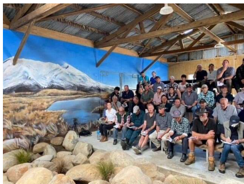
Attendees at Ruapehu Red Deer's sale on 9 December. The average achieved there was in line with sales held in 2017 and 2018 but up on last season.

An estimated $4.9m changed hands on sale day throughout the season, down on the $7.9-$8.0m for the previous two years.