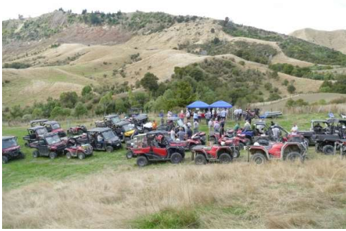
Attendees at the field day on 30th March.