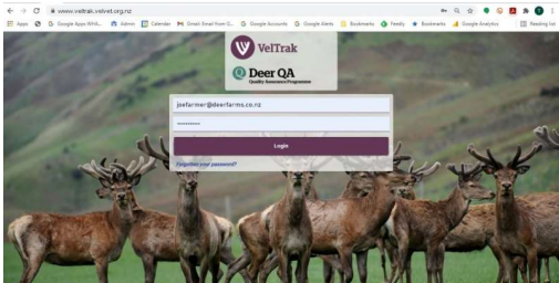
The VelTrak log-in page that will become familiar to everyone involved in the velvet industry by the start of the next (2021/22) season. This is where vets will order and allocate black VelTrak tags and farmers will approve eVSDs generated by their velvet buyer or receiver.