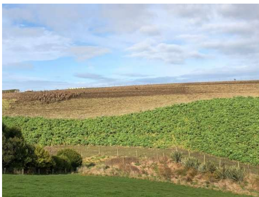
Great deer winter grazing management: Grazing from the top of the slope; baleage on site; no back-fence; wide buffer strip between the crop and the creek

The NZDFA therefore strongly encourages its members to take the topic seriously. The government will be introducing intensive winter grazing regulations in 2022. If bad practice is seen to be widespread this winter, it will be used to justify tougher regulations and more compliance issues for all farmers. Not just for those who aren't doing the right thing.