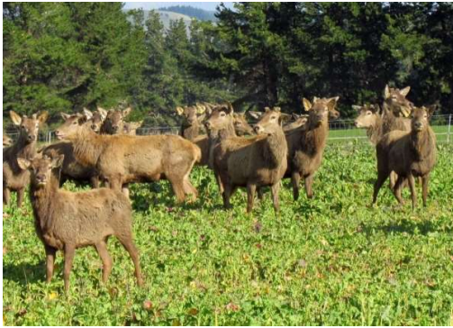
Happy stags on winter crop

The National Environmental Standard (NES) for intensive winter grazing has been deferred for 12 months, but that's little consolation for deer farmers in Otago. The region's Plan Change 8 introduced last year still applies, including rules around intensive grazing.