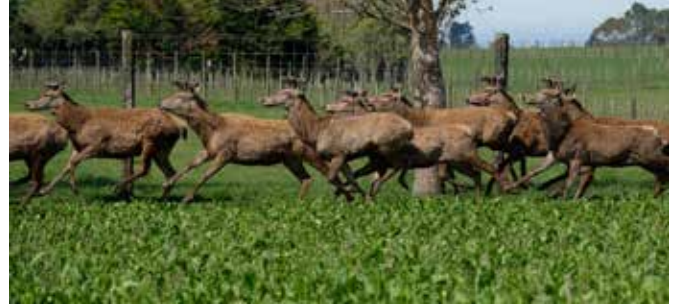
Velvetting stags on the Netherdale block. DNA parentage testing is being used to help identify the high and low-performing bloodlines.

Weaning is done pre rut because it gives the flexibility to mix hinds into single-sire mating mobs. And because the autumns are usually kind, hinds can be safely run on the harder country while young stock are given the pick of the best feed. First fawners are mated to two-year-old sires.