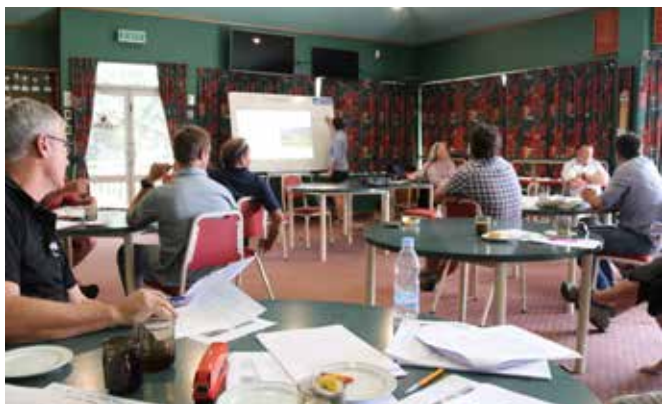
Workshop attendees.