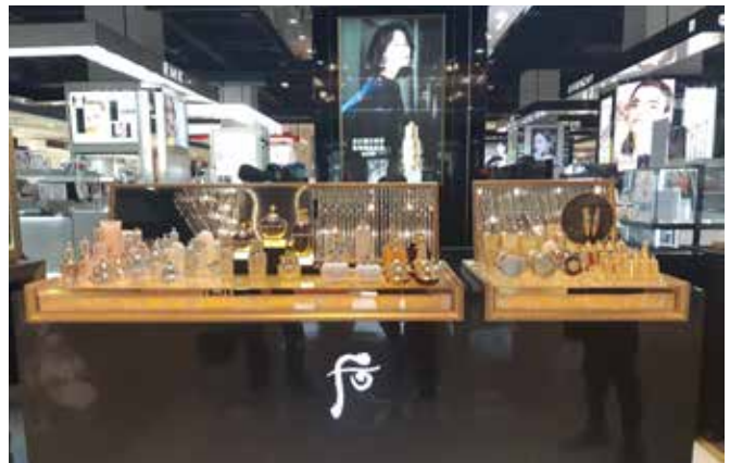
Department store at Taipei 101 featuring cosmetic products containing New Zealand velvet.

Or perhaps you are going to a high-end cosmetics shop in Taipei or Shanghai. There is a chance that among famous brands such as, Chanel, L'Oréal, Estée Lauder, or Givenchy, you will find a well-respected Korean company prominently displayed. The interesting thing about this cosmetic brand (parent company is LG) is its purported use of New Zealand velvet in its luxury products. ■