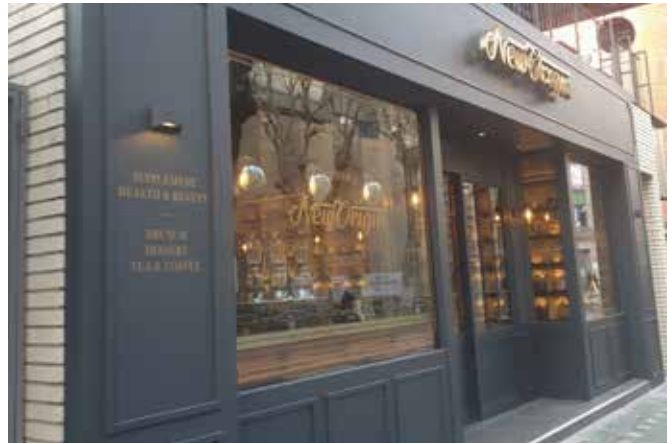
New Origin store in Seoul – the tenth such store to open in the city.

With the increasing volumes, New Zealand exporters worked hard to ensure they