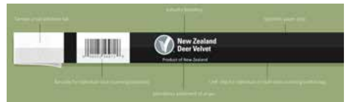
The preferred wrist-band style of velvet tag.

What the proposal means for different velvet supply chain participants can be viewed in detail on the DINZ website at: deernz.org/velvet-traceability ■