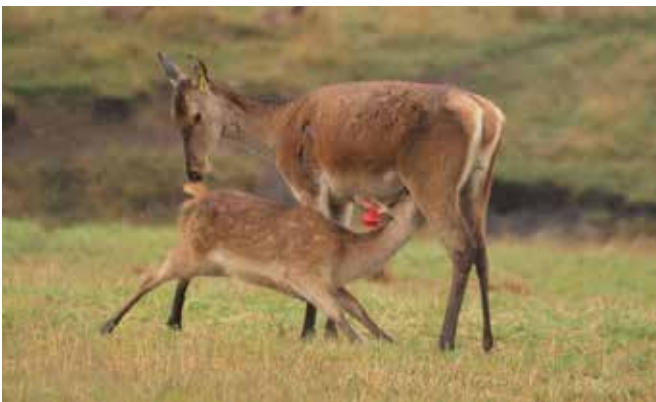
Spotting a fawn feeding is one of the surest ways of pairing.