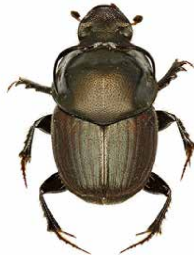
Onthophagus taurus , suited to deer and sheep and the Southland environment.

Introducing them required a bucket of fresh deer faeces – nice and moist and less than 12 hours old. The beetles are placed onto the pat and more faeces piled on top – not everyone’s idea of a great first day on the job, but the O. taurus seemed happy enough.