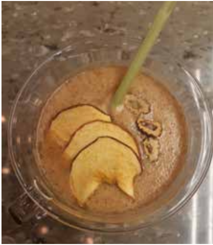
New Origin's new velvet "energy tea".

Reportedly prices have firmed slightly over last season, continuing the relative stability achieved over the past eight years. With production at about 725 tonnes and an average farmgate price of $125–135/kg, New Zealand velvet is closing in on becoming a hundred-million-dollar industry.