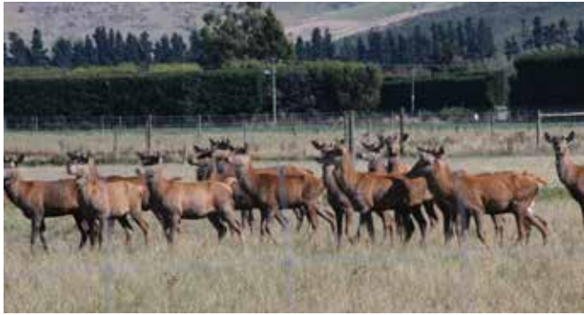
Stags on the Riverslea home block.