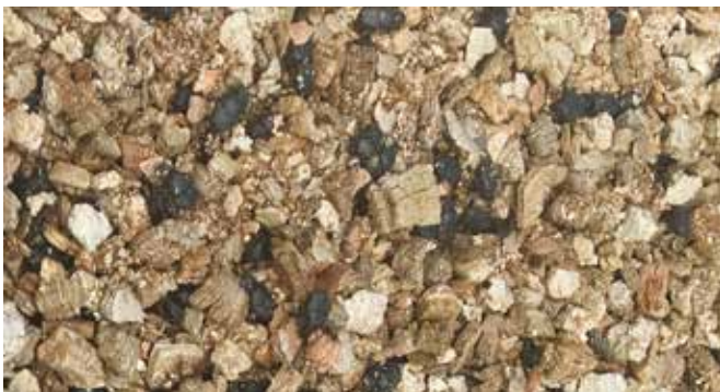
The beetles on arrival.