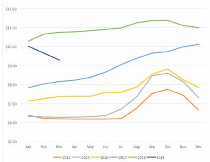
Figure 1: National published schedule: 2014–2019 (monthly averages).

Although prices have eased, exporters report that venison demand remains strong and they look forward to continued high pricing. ■