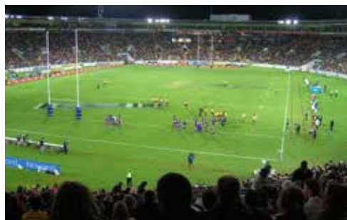
Cap off a great two days with an evening watching the mighty Hurricanes take on the Jaguares.

There's plenty of scope for socialising, including morning and afternoon tea and lunch breaks in the display area, a networking breakfast on Friday