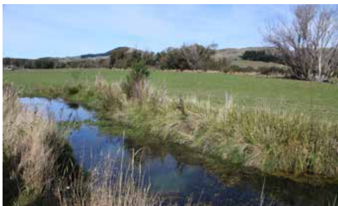
This spring-fed waterway on the home block feeds into a large pond, and has been well protected from livestock.