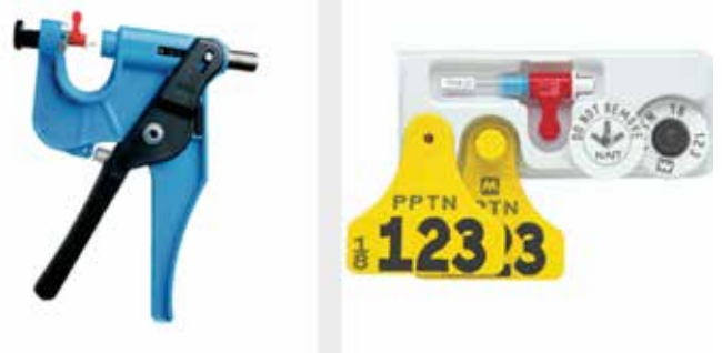
Example of tissue sampling applicator and kit.

information-rich technology has the potential to tell much more in future: AgResearch's animal DNA genotyping business, GenomNZ, is looking at genomic breeding values and the identification of both lethal and desirable traits.