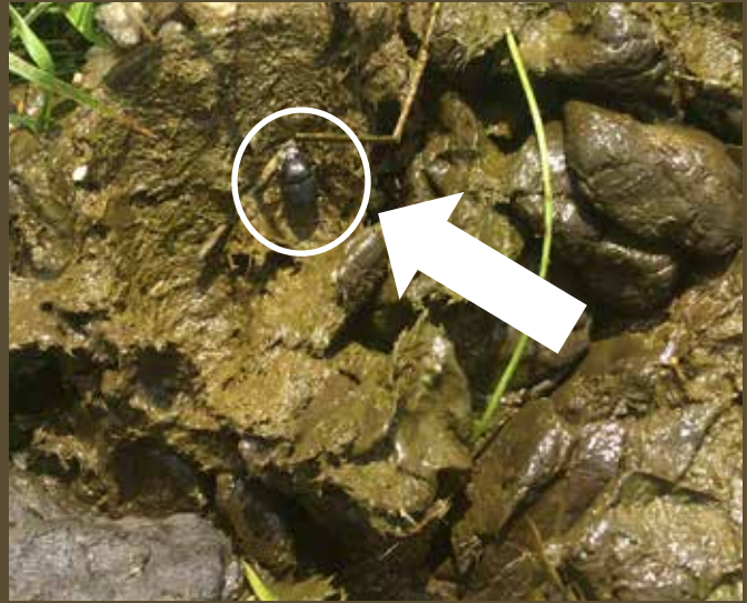
It's a crap job, but someone has to do it: A dung beetle (arrowed) explores its new Southland environment.

It's that time again! The MSD Animal Health Photographic Awards are on again this year, so let's show them and the world what makes our animals and industry so special.