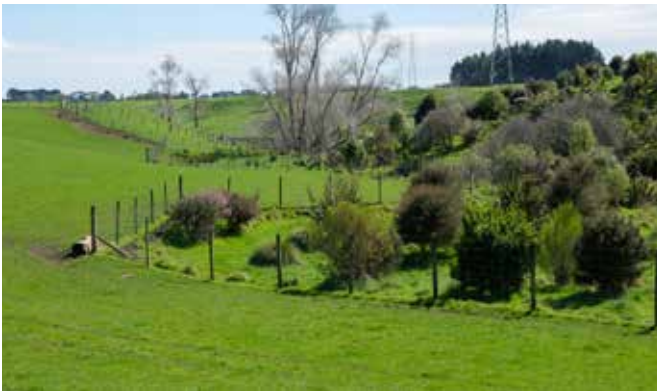
The first plantings for environmental enhancement are starting to mature.

The main environmental risk where deer are run is pugging on the wetter, heavier soils. Lifting some fodder beet crops rather than feeding in situ helps mitigate this. They are also filling in damaged areas around troughs, but controlling deer behaviour and wallows is a constant challenge.