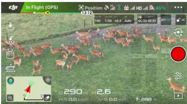
A drone will prompt fawns to run to their mothers and help speed up visual pairing.

A key part of speeding up the process has been using a drone to get settled and snoozing fawns back on their feet and paying attention to their mothers. Previously, timing of pairing relied on the mob being active and fawns being hungry enough to seek their mothers for a drink. With fawns often settling for a couple of hours between feeds, this limited opportunity for pairing. The drone,