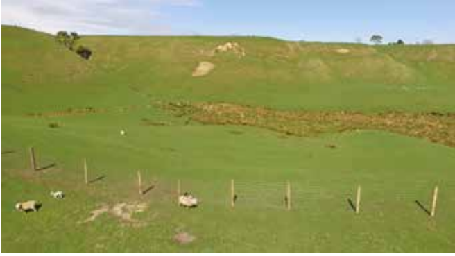
Sheep fencing on the Laird block is being replaced with deer fencing to accommodate hinds for fawning on more suitable terrain.